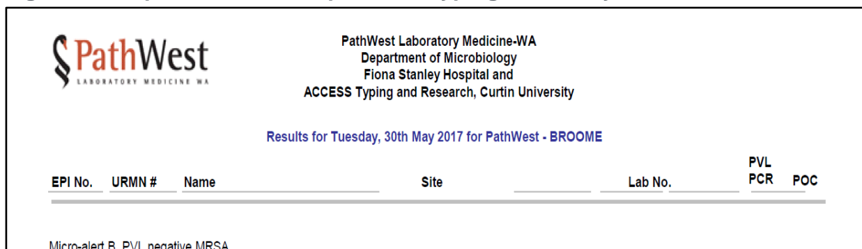
Figure 4 Sample MRSA HCF report from typing laboratory